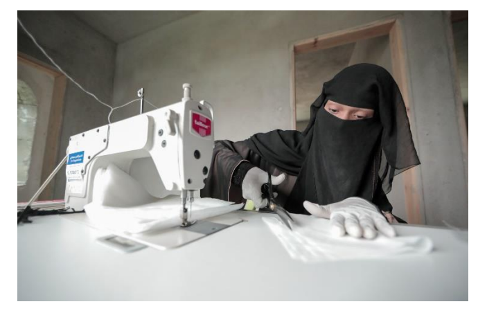
A displaced woman sewing face masks at a displacement site in lbb governorate

IOM in Tunisia provided food, PPE, clothes, and