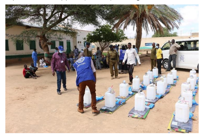
IOM distributed PPE and essential items to vulnerable migrants in El Fasher, North Darfur

In Morocco , IOM continues to coordinate assistance to migrants, alongside other UN agencies, through the UN Network on Migration and as part of other UN task forces. IOM also coordinates the work of partners that covers different regions in Morocco through local regional councils. Several strategic meetings were held with the Ministry of Health (MoH) during the reporting period to discuss a common work plan on Mental Health and Psycho-Social Support (MHPSS) for migrants.