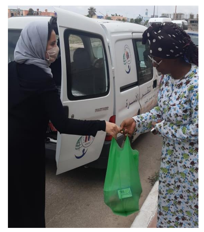
Food basket and hygiene kit distribution by IOM Morocco's civil society organization (CSO) partner, AMPF

IOM in Yemen continues to improve Water Health and