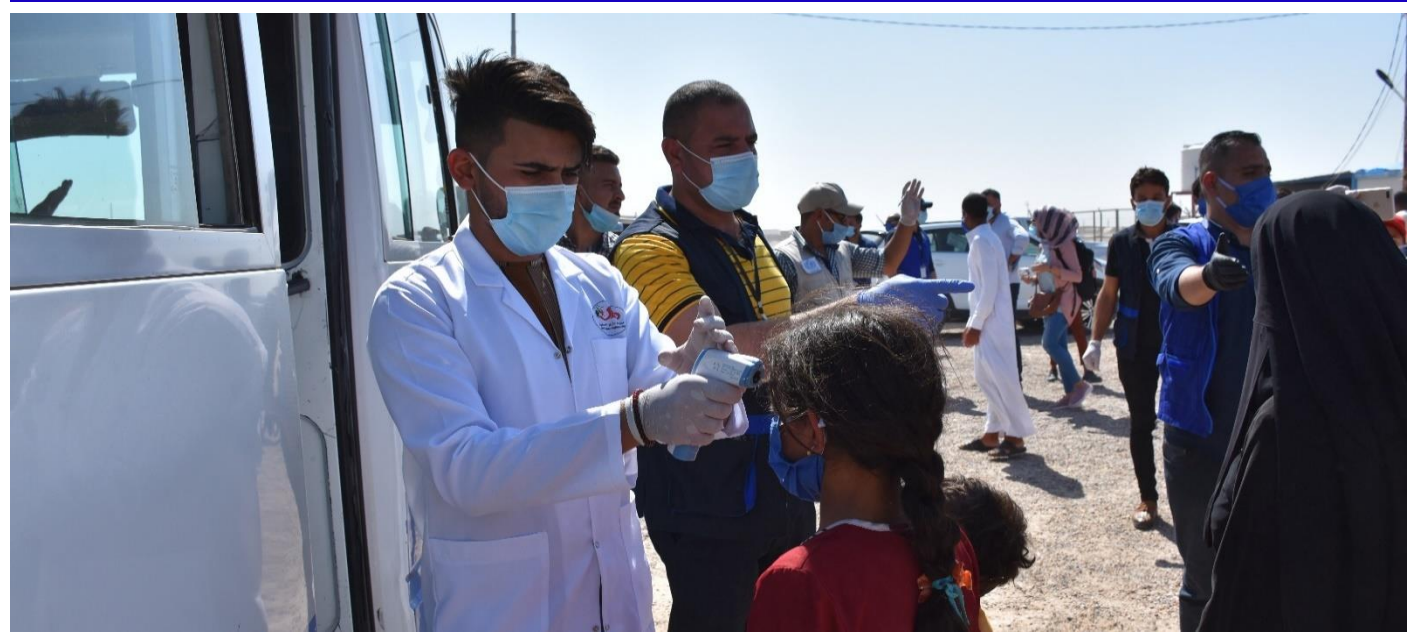
A health worker conducts temperature testing for returnees from AFF Camp to Fallujah