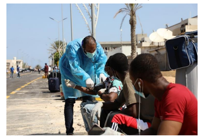
All migrants prior to departure were medically screened by IOM and received PPE, including masks, gloves, and hand sanitizer

In Libya, IOM's medical teams supported the National Centre for Disease Control (NCDC) staff at Ras Jdeer and Mitiga airports by providing medical check-ups to all passengers returning to Libya as part of the IOM COVID-19 Strategic Preparedness and Response Plan. In total, 256 passengers were screened, while samples for PCR tests were collected. The travellers were also provided with health awareness sessions at the airport. IOM's Medical Team also conducted two, two-day training sessions for 25 PoE health workers on COVID-19 case management and Infection Prevention and Control (IPC).