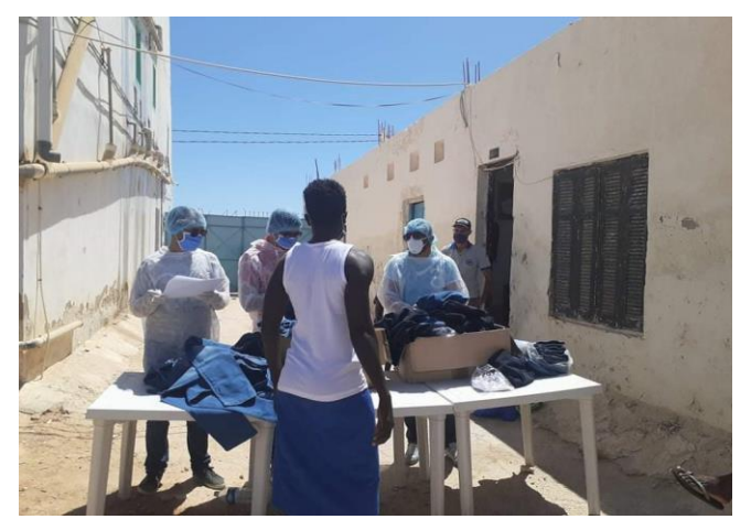
IOM Tunisia provides food, Personal Protection Equipment (PPEs), clothes as well as counselling sessions to 120 vulnerable migrants in Médenine

In Yemen, IOM's Displacement Tracking Matrix (DTM) recorded 1,100 household (HH) displacements between 23 and 29 August 2020. In total, 21,703 HH have been displaced since the beginning of 2020. This figure includes 1,545 HH that reportedly moved from areas like Aden to more sparsely populated areas in Lahj, Abyan and Al Dhale governorates, due to fears of contracting COVID-19. In August 2020, COVID-19 related displacements have decreased substantially, while displacements from conflict, particularly in areas like Hudaydah, Al Bayda and Taizz governorate, continue.