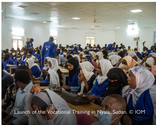
Launch of the Vocational Training in Nyala, Sudan.